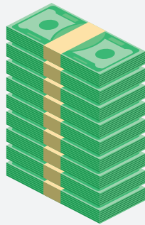
Manufacturing $34.42 Average Hourly Pay